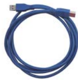
USB 3.0 cable