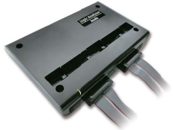
270 x 175 x 55 (mm 3 )